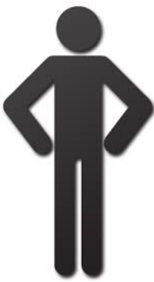
Your Stalker TM *

Upon acquiring Your Stalker TM , please consult this operator’s manual before use for all instructions and warnings.